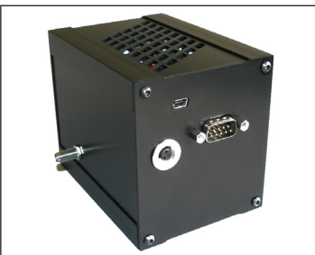
Very compact and robust scanning USB spectrometer irSys Type I, its dimensions measuring only 104 x 75 x 85 mm 3 .

USB spectrometer irSys Type 1 Power supply USB cable & drivers Spectrometer software & documentation